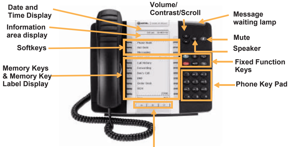
Memory Key Page Navigation Buttons (used to navigate through 3 pages of memory keys)